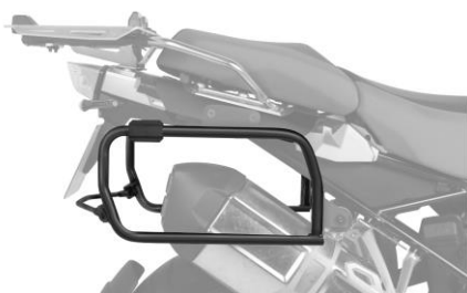
Specific 4P fittings