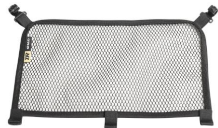
Inner mesh X0TR01 One included with right hand side case